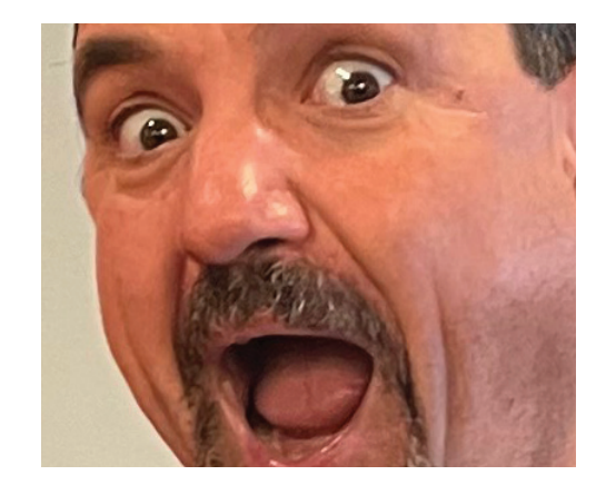
Giants fans respond to great start of season. Beat Philly!!!